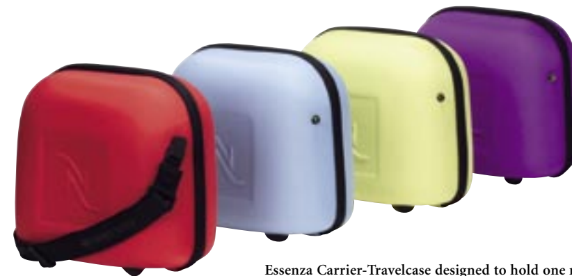
Essenza Carrier-Travelcase designed to hold one machine. See Mail Order, page 79.

With the new Essenza collection, Nespresso gives the hip colours of the swinging 60s a new lease on life. The pastel hues of Lemon Zest and Retro Blue unmistakably recall the dynamic art deco stronghold Miami. The energizing, “lipstick-shades” of Spicy Orange and Fizzy Fuchsia were inspired by the elegant glamour of Capri. What they all have in common, however, is the pure joie de vivre that this successful Nespresso machine serves up with every cup.