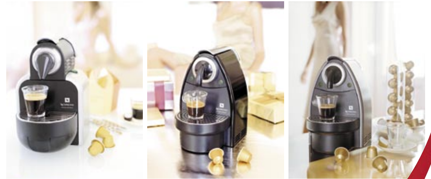
The Nespresso Essenza Automatic is available in two different models (far left and above) and four colours: Piano Black, Arctic White, Metal Grey and Titan Grey.

Not only is it beautiful on the outside; its inner values are equally impressive. Which is what makes Nespresso's new Essenza Automatic the perfect seasonal gift for sophisticated coffee aficionados.