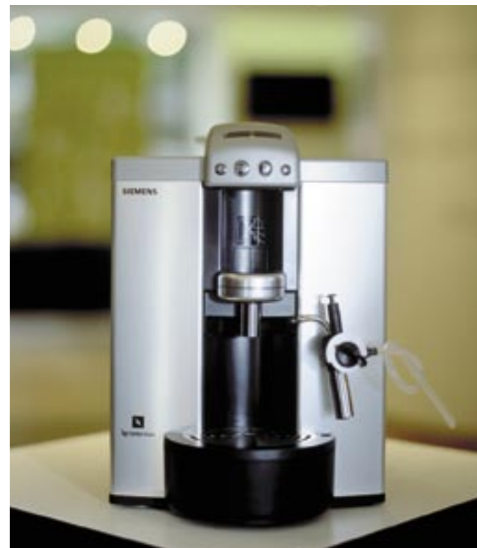
Nespresso Siemens SN70 Romeo, Top Line.

A machine that beautifully brings together a clear and simple design and state-of-the-art technology thus guaranteeing perfect coffee pleasure. The eye-catcher is the small "balcony" upon which the coffee capsule is placed for the preparation. Everything else, such as the capsule insertion and ejection, happens automatically, just like a CD player, at the simple pressing of a button. The silver grey polished aluminium front elegantly conceals the sophisticated technology responsible for this ease of use. The special foaming device allows users to choose between milk foam for Cappuccino and hot milk for Caffe Latte. In short, a coffee machine that serves as an eye-catcher even in a professionally equipped stainless steel kitchen.