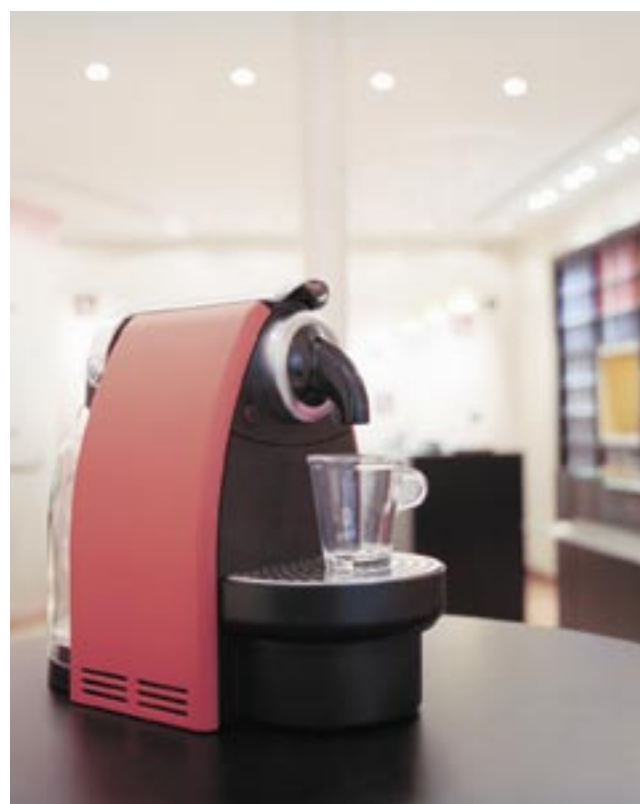
Nespresso Essenza D90R, Compact Line.

Technical Specifications: Metallic grey ABS housing, high pressure pump (19 bar), thermoblock heating element, programmable volume control, back-lit controls, removable steam nozzle for hot water and steam functions, specific steam nozzle for Cappuccino/Caffe Latte, ejection of used capsule on opening the jaw device, collection container for used capsules, inbuilt warning sound that indicates when the collection container is full, removable water tank (1.2 l capacity), measurements: 22 x 35,5 x 31 cm