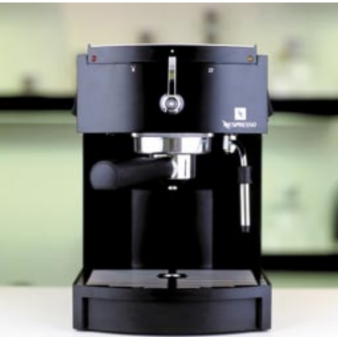
Nespresso D150, Classic Line.