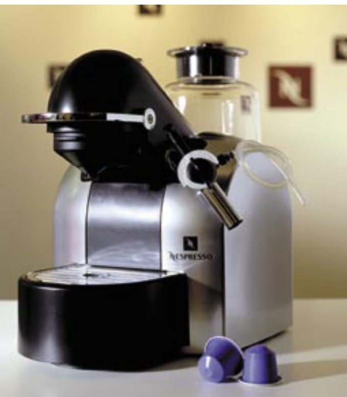
Nespresso D290, Concept Line.